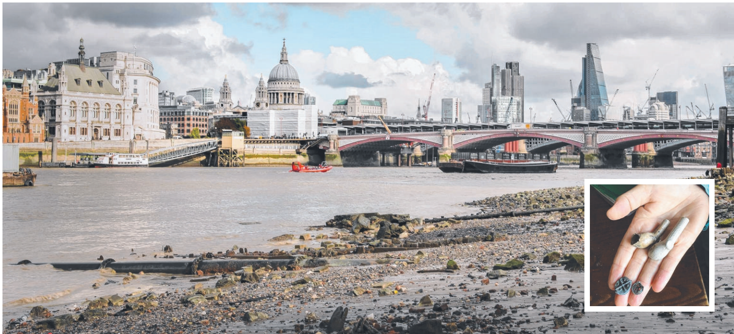
Muddy shores of the Thames; inset, mudlarking finds include medieval traders' tokens and clay pipes